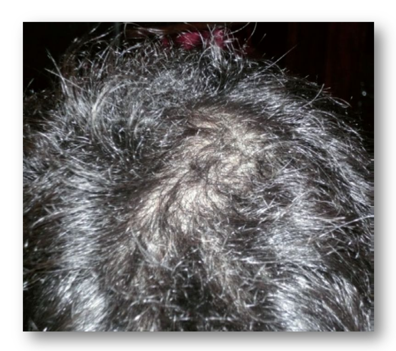
Plinest Hair - 10 sessions, micro boluses techniques