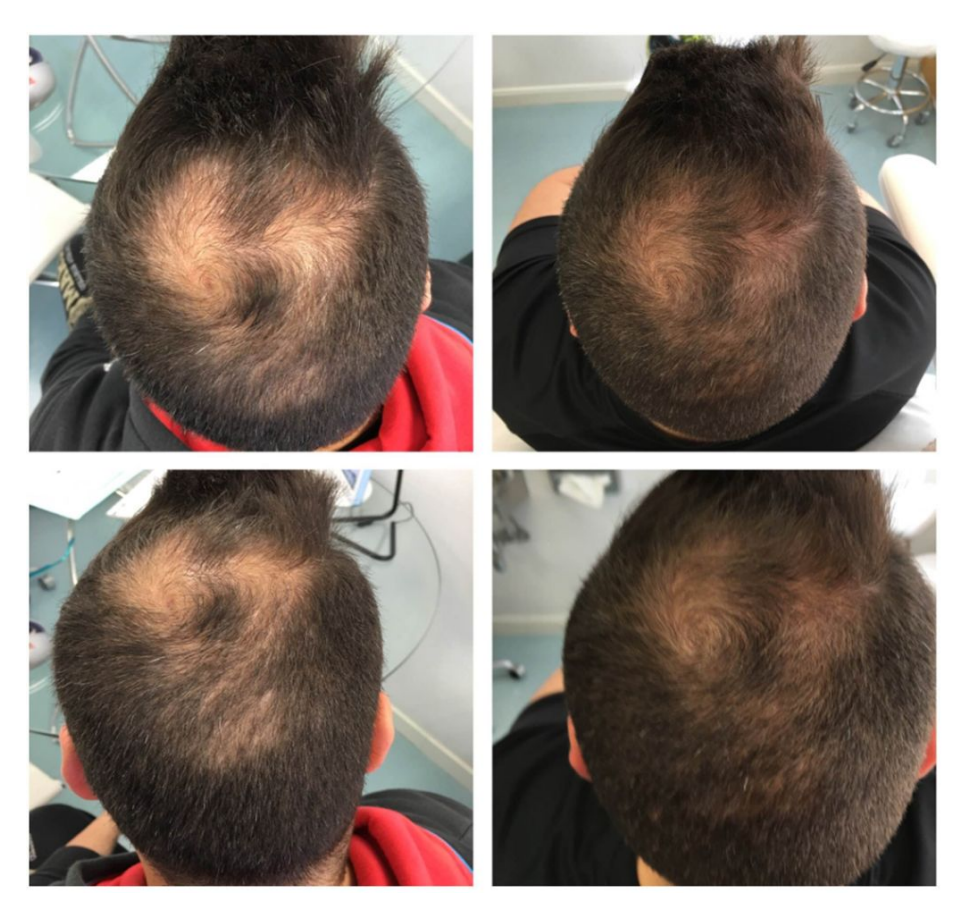
Plinest Hair - 10 sessions, micro boluses techniques