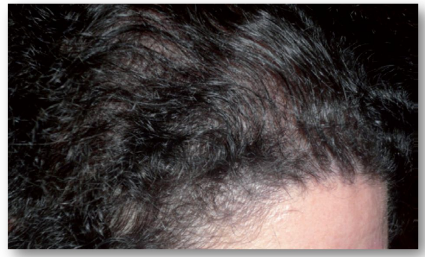
Plinest Hair - 10 sessions, micro boluses techniques