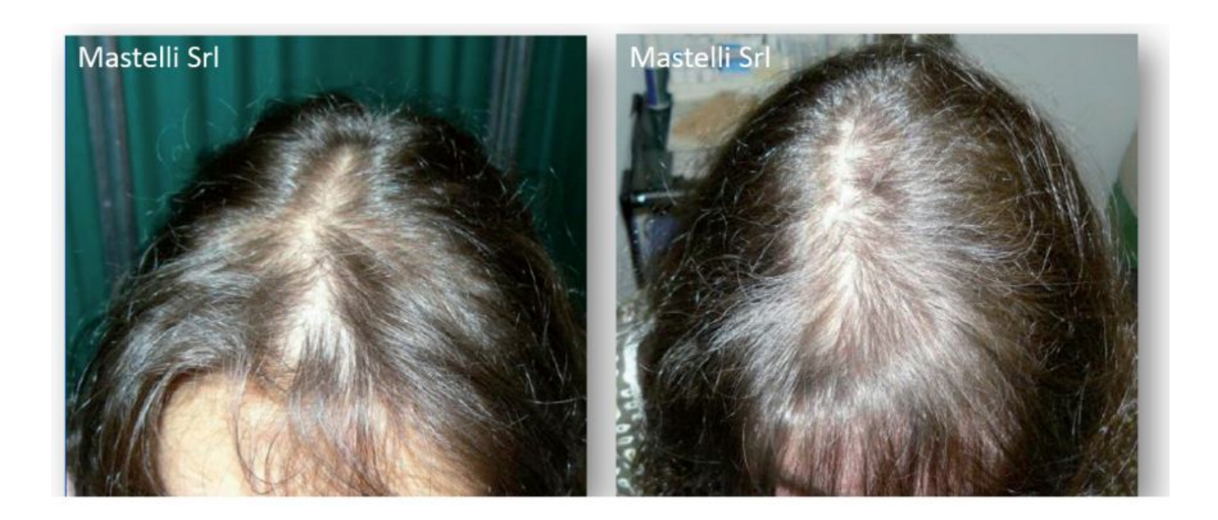
Plinest Hair - 10 sessions, micro boluses techniques