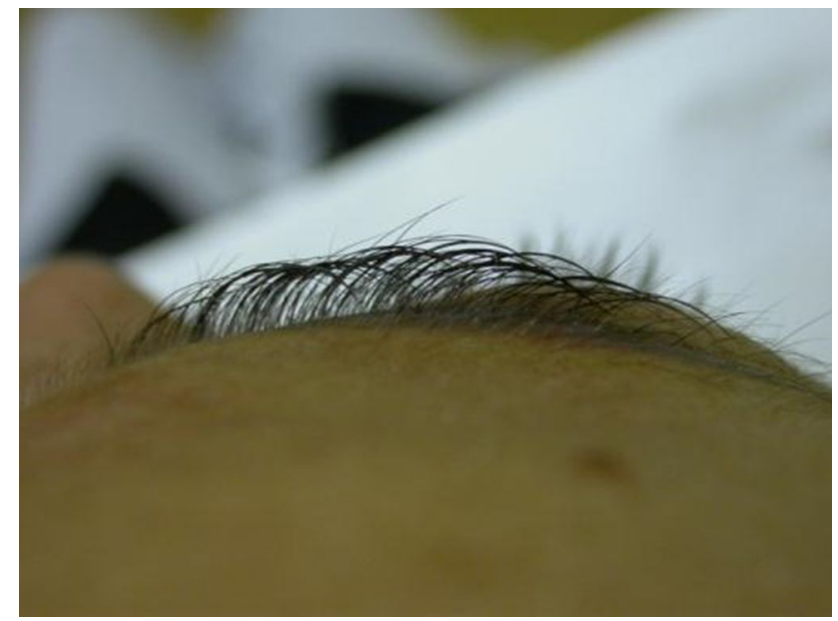
Plinest Hair - 6 sessions, micro boluses techniques